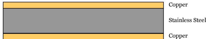
Cross section of CopperPlus

CopperPlus is a metallurgically bonded metallic composite strip produced by roll bonding. The roll-bonding process is based on solid-state welding technology, requiring no adhesive or brazing alloys to achieve a clean, permanent, bond. The clad material has excellent bond integrity due to the nature of the metallurgical bond that develops between the copper and stainless steel layers.