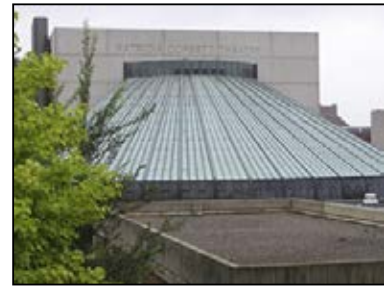
Patricia Corbett Theater, University of Cincinnati, CopperPlus roof installed in 1971