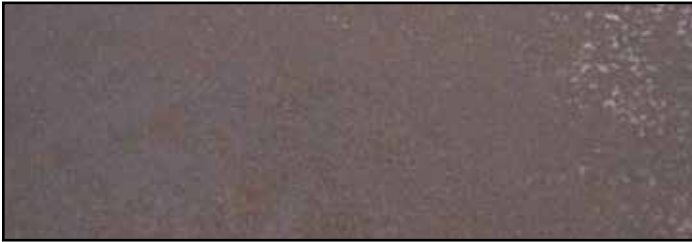
Figure 2. Salt coated steel sample after 500 cycles.

CondenStop® Corrosion Resistance Sheet agwaymetals.com