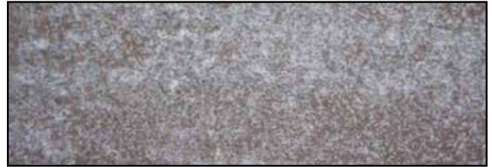
Figure 3. Salt coated steel sample with CONDENSTOP after 500 cycles.

After 500 cycles, the non-covered steel samples showed relative large red iron-rich rust spots, viewing under the optical microscopic further revealed many very small rust-like features. These typical corrosion characteristics were rarely observed on the steel samples covered with CONDENSTOP. The salt coated steel samples directly exposed to the lab atmosphere were heavily corroded as shown in figure 2; the surface morphology of the mild steel sample showed that red-brown, iron-rich, rust covered the whole surface. The salt coated steel samples covered with CONDENSTOP however, while also corroded, showed significantly less oxidization than the bare samples, as shown in figure 3.