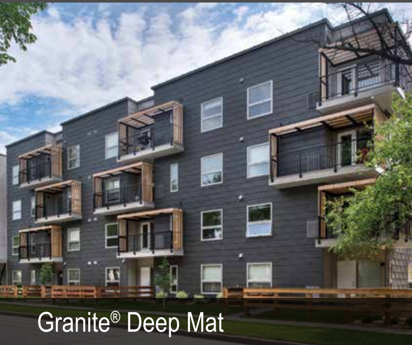
Granite® Deep Mat

With AGWAY's A606 Weathering Steel product, you'll be able to deliver a classic, 'weathered' look, with a unique, rust-like appearance that, in the past, could only be accomplished by Mother Nature.