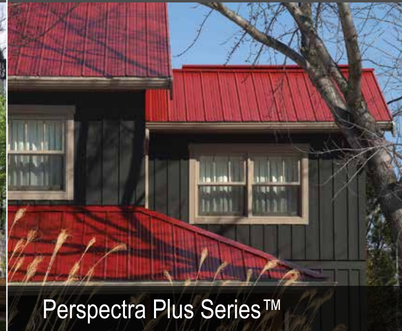
Perspectra Plus Series™

Granite® Deep Mat is an organic, coated steel with a standard paint thickness of 35 or 40 microns. Architecturally attractive aesthetics with a mat finish that provides a unique wrinkled surface finish. The colours present a natural look and feel to the overall project.