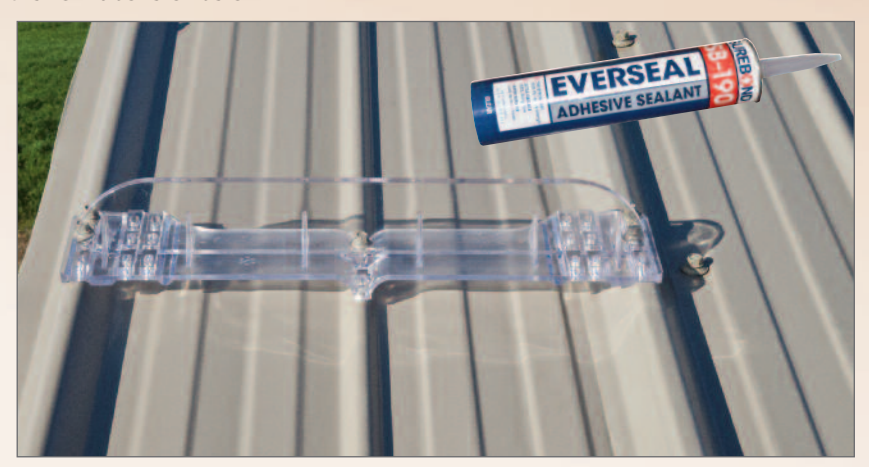
Next higher or lower unit will start on this rib.

For the most effective Snow Control, stagger the SnoBars both vertically and horizontally on the roof. Vertical spacing should be in the range of 16" to 18" and will depend on the substructure; horizontally, each successive SnoBar should start on the same rib as the previous one ends in the row above or below.