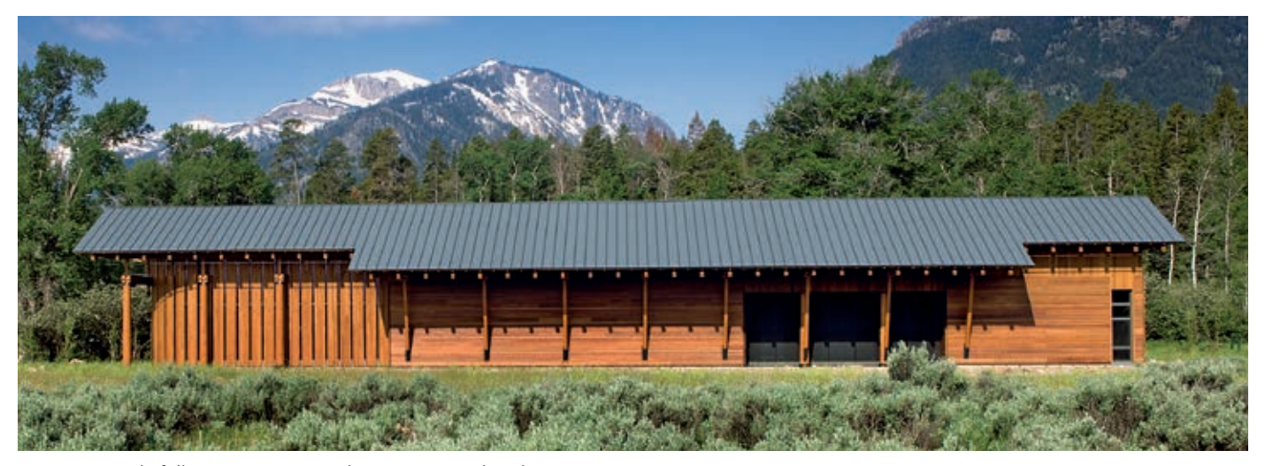
Laurance Rockefeller Preserve, Grand Teton National Park, Wyoming, USA LEED™ Platinum Certified – Carney Logan Burke Architects, Jackson, WY, USA Application: Double Standing Seam Panels, RHEINZINK-prePATINA graphite-grey