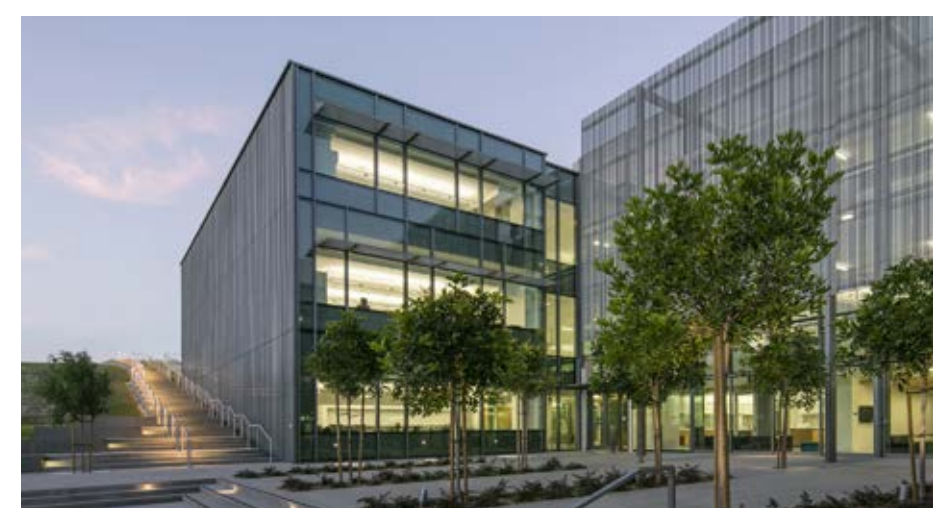
Loyola Marymount University (LMU), Los Angeles, CA, USA LEED<sup>TM</sup> Gold – CO Architects, Los Angeles, CA, USA Application: Perforated, RHEINZINK-prePATINA blue-grey