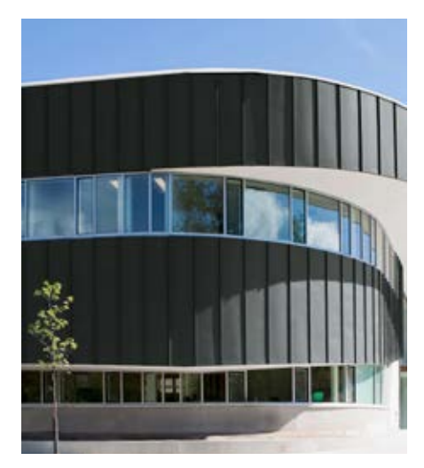
Simcoe County Admin Building, Midhurst, ON, Canada – LEED<sup>TM</sup> Gold Teeple Architects, Toronto, ON, Canada, Application: Vertical Reveal Panels, RHEINZINK-prePATINA graphite-grey