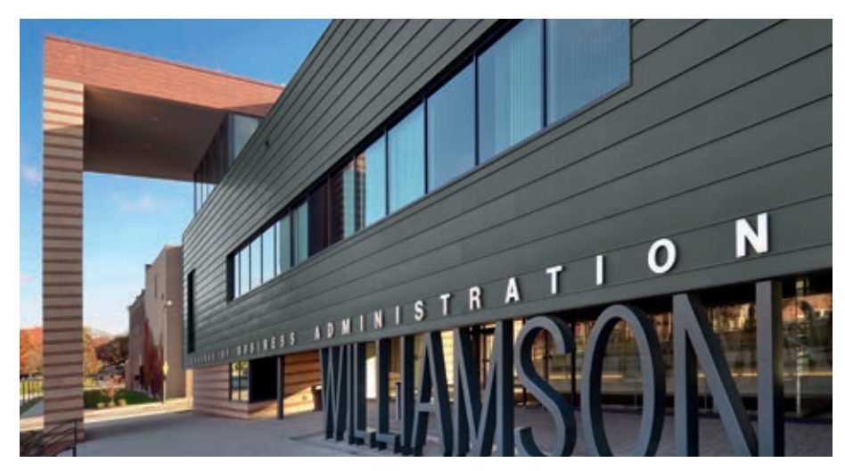
Williamson College of Business Administration, Youngstown State University, Youngstown, OH LEED<sup>TM</sup> Gold – Perkins+Will, Minneapolis, MN and Strollo Architects, Youngstown, OH Application: Angled Standing Seam Panels, RHEINZINK-prePATINA graphite-grey