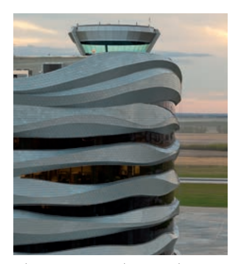
Edmonton International Airport, Edmonton, Alberta, Canada – LEED<sup>TM</sup> Silver DIALOG Architects, Edmonton, AB, Canada Application: Flat Lock Tiles, RHEINZINK-prePATINA blue-grey

Ideal for roofing, façade cladding, and gutter applications, RHEINZINK is an alloyed zinc allowing innovative inspiration while minimizing the project's carbon footprint. Available in bright rolled, bluegrey and graphite-grey. RHEINZINK titanium zinc is declared as an environmentally friendly building product by the German Institute of Construction and Environment (Institut Bauen und Umwelt e.V.), based on ISO 21930 and ISO 14025 Type III.